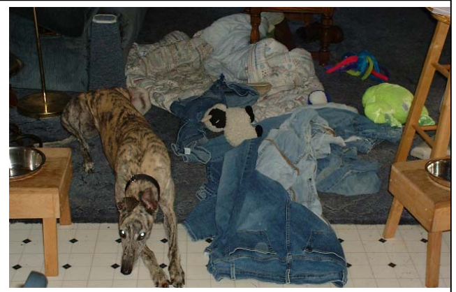
Jetta showing off her 8 am handiwork - bringing my clothes to the livingroom!

Once you get the hang of it, it is fun and rewarding.