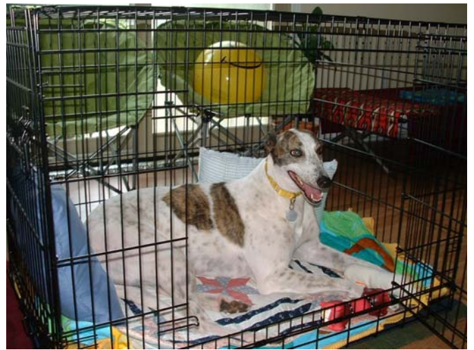
Angie 'chillin' out in her crate