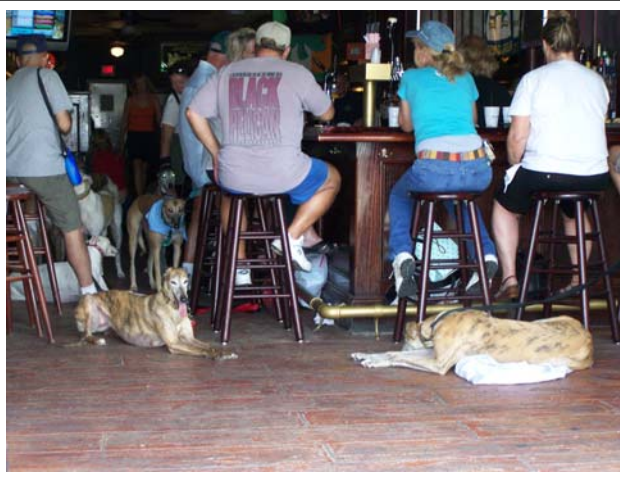
Top= Fun at the Hund Run Bottom= Thirsty dogs (and humans) taking a pub break Right= One of the many costumes at Saturday nights costume contest