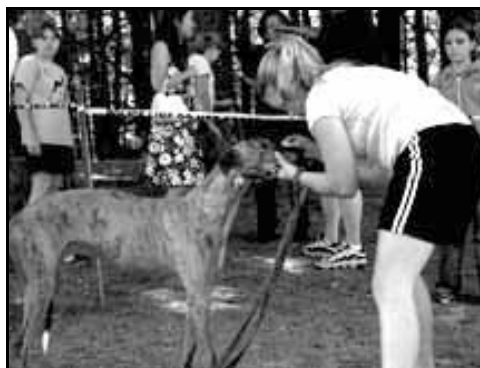
The treat on the nose trick