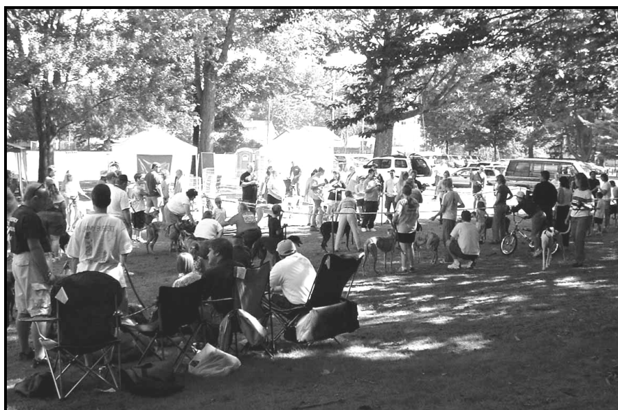
The main event area was quite busy!