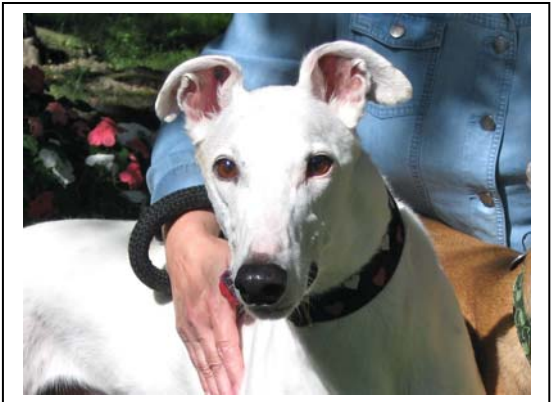
Butch a.k.a. Go Bon Butch 2001 to 2010

In reviewing the highs and lows of 2010 our family experienced one very sad event. We lost our beloved greyhound Butch to a debilitating illness. Butch was a rescue greyhound that we adopted five years ago. He was a wonderful companion, full of life and affection and a true member of our family. It broke our hearts to say goodbye, and we were not the only ones who felt the loss. Butch's greyhound partner Edie went into a complete tailspin, moping around and ignoring her food. Two short weeks later we were actively looking for a new friend for Edie (and for us). Enter Tia, a peppy little two-year-old rescue greyhound who has turned our house upside down. As I'm sure you know greyhounds are addictive. We've found that you can't have just one and once you start adopting them, you can't stop. Edie and Tia have become best friends and our household once again feels complete. We love our new duo, but Butch, our first greyhound, will always have a special place in our hearts.